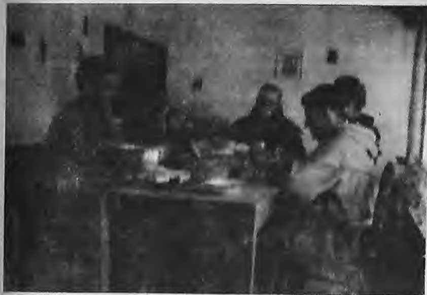
Above: The first community of Minims in Chilapa, which did not persevere. (Photograph taken in November 1970)

Note: I have made these notes ending at 11 in the morning. In Chilapa, Guerrero, Mexico. • The poor Portavoz of Jesus ■